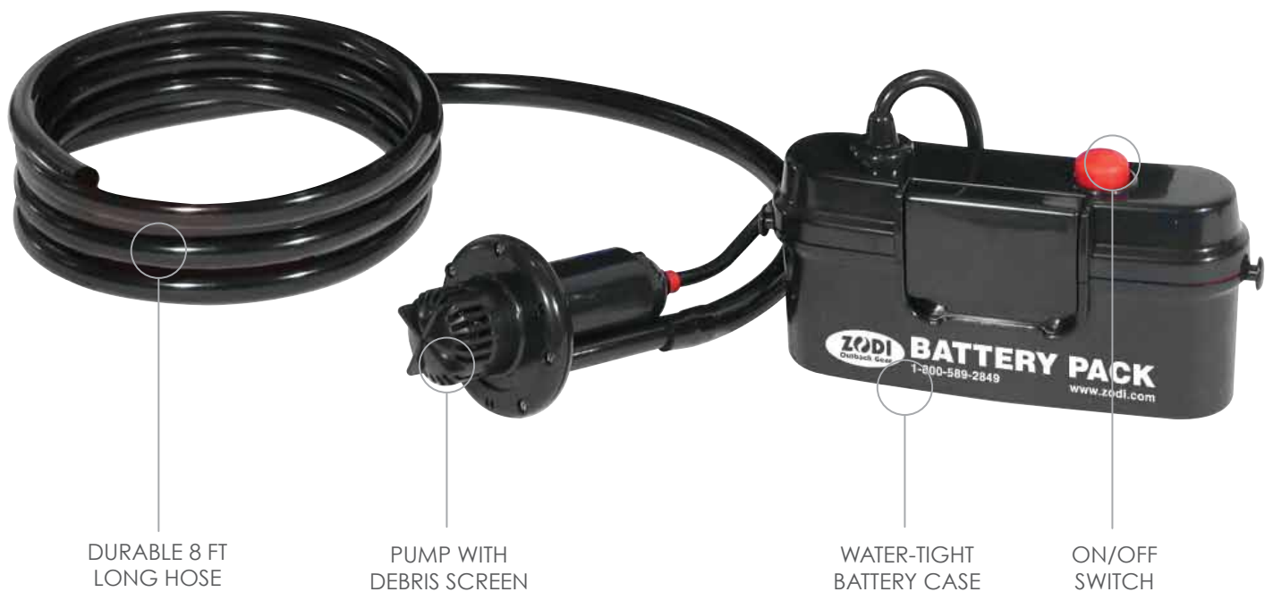
DURABLE 8 FT LONG HOSE