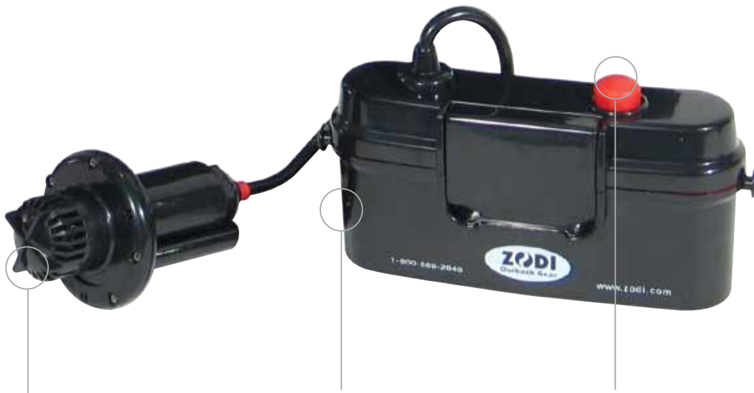
PUMP WITH DEBRIS SCREEN